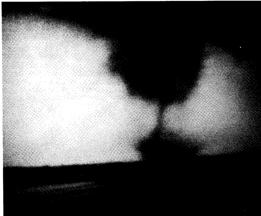
Partial view of Doug Hall's installation

Hall's piece combined a large video projection of natural power (storms at sea, tornados, et al), with a small video monitor displaying in black and white manmade power (turbines, supercomputers) and several pieces of metallic furniture hooked up to a bank of homemade batteries (giving a considerable shock to the touch), to consider our fascination with power on the largest and most intimate scales.