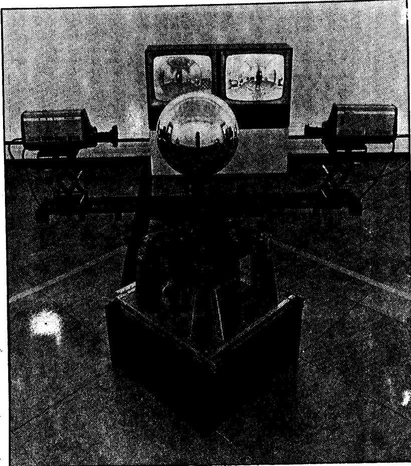
Steina Vasulka's "Allvision," from the 1976 "Machine Vision" series

"Matrix" was a groundbreaking work when conceived, but today, when phalanxes of video monitors appear everywhere from bank lobbies to airport terminals to