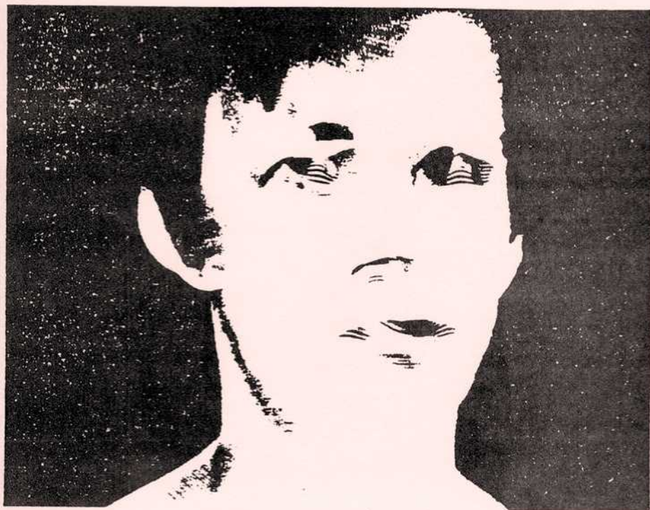
Steina's self-portrait alters the image, challenging our preconceptions.

Most people approach video like films: Cameras—film or video—are windows on the world. Steina and Woody Vasulka took this traditional stance when they began taping arts performances in New York lofts and clubs in the mid-sixties. But soon their frame of reference changed. They became more interested in how the camera worked than in what was in front of it. They covered the lens and constructed images, playing with pixels (the smallest unit of a video image), altering raster lines (the 525 lines that form the image on the screen), making pictures from inside instead of outside the camera.