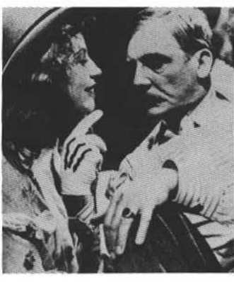
Lotte Lenya in The Threepenny Opera