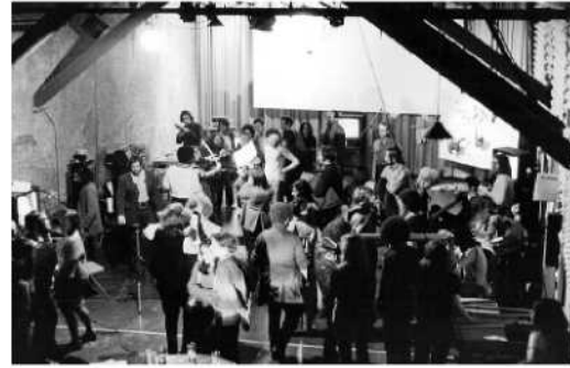
The Kitchen, 1972

absolutely a closed medium to me. I was educated in film at a film school. I was exposed to all the narrative structures of film, but they weren't real to me and I couldn't understand what independent film was. I was totally locked into this inability to cope with the medium I was trained in. So for me, video represented being able to disregard all that and find new material which had no esthetic content or context. When I first saw video feedback, I knew I had seen the cave fire. It had nothing to do with anything, just a perpetuation of some kind of energy . . .