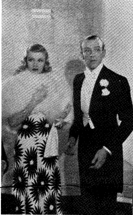
Dressed to the hilt: Ginger and Fred in Shall We Dance

*NOTE: Dance will play as the second half of a double bill with The Gay Divorcee on Feb 26 (all seats $3.00). Dance will play as a single feature on Feb 27 (Price A)