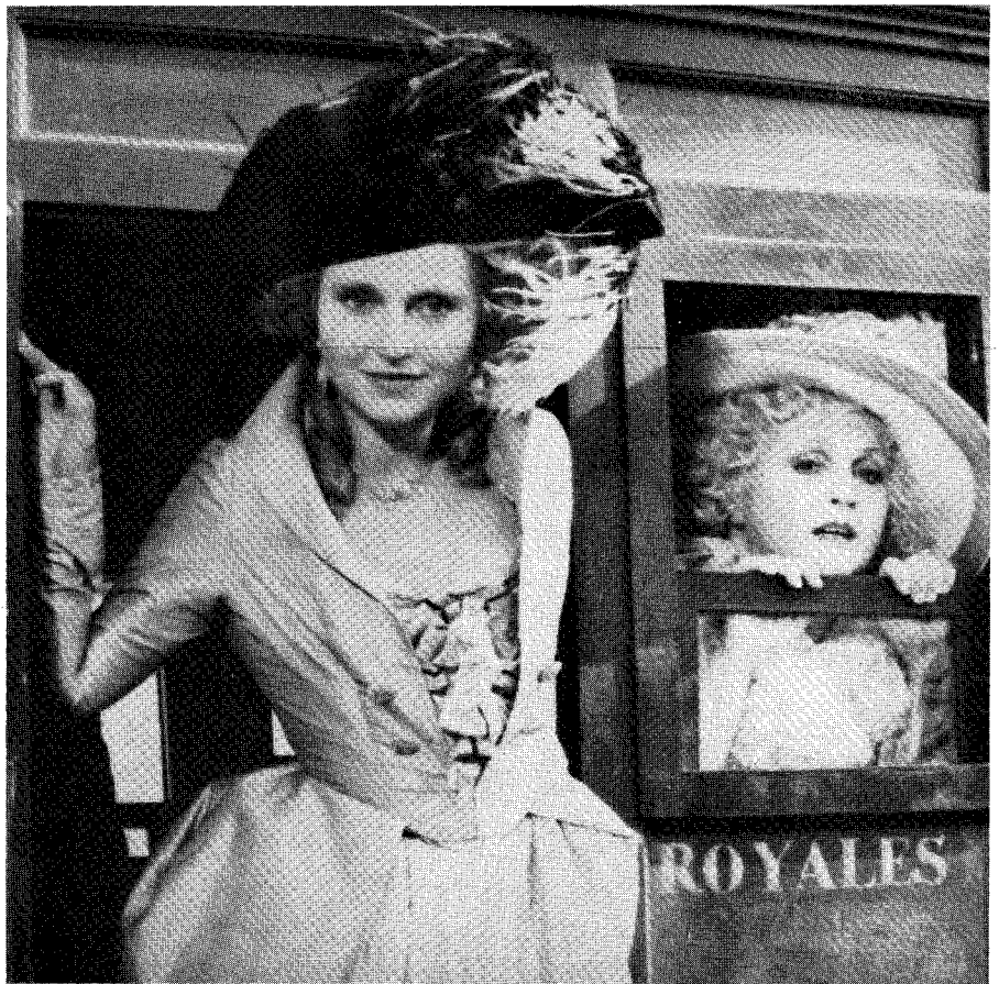
Above: Hanna Schygulla in That Night at Varennes