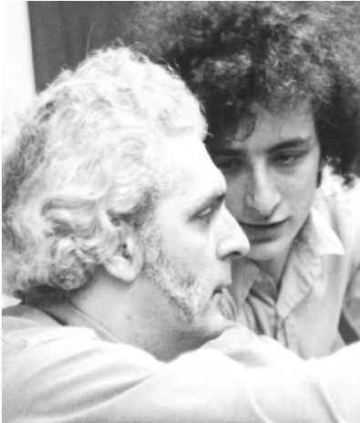
Robert A. Moog at conference on Electronic Art Tools, at SUNY, Buffalo, 1977