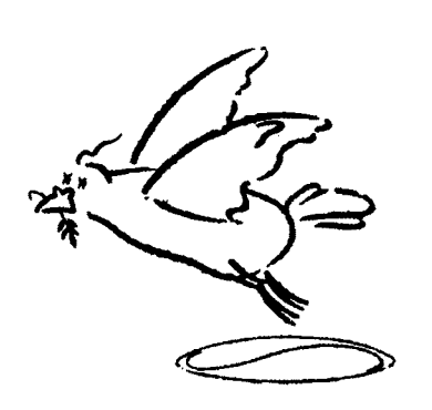
백남준 · 란스 베루기스 · 황병기 · 스 타이너 퍼포먼스