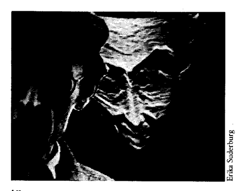
The Art of Memory