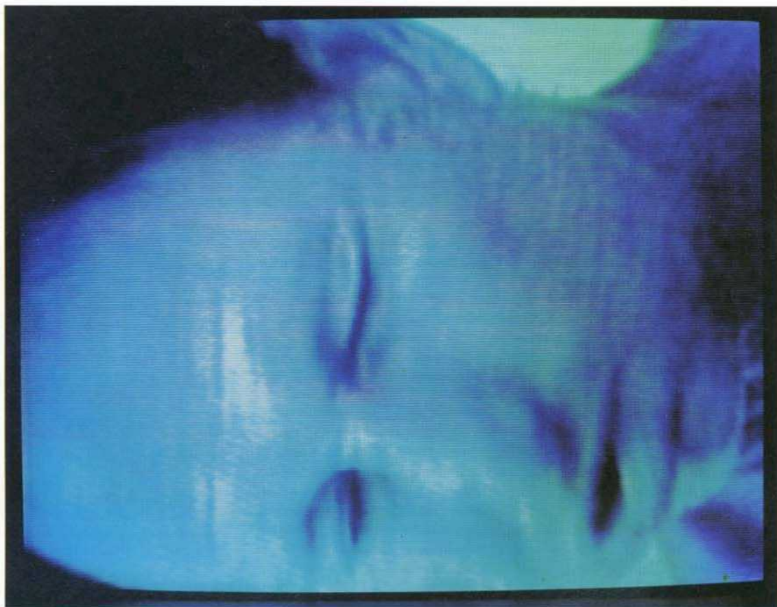
above: Bruce Nauman, Raw Material: Brrr, 1990 (detail). Two-channel video and two-channel sound installation, 60 minutes, color; installation area variable, approximately 6.25 x 7.5 m. ZKM/Center for Art and Media Karlsruhe.

Nauman also makes use of video in an earlier work, Video Surveillance Piece (Public Room, Private Room) (1969–70), but instead of exaggerating the distortion of time in edited video, in this piece he exploits the "real time" inherent in live feed, while simultaneously turning video upon itself. In each of the two rooms of the installation, one of which is closed to the audience, a video camera sweeps back and forth to survey the contents of the room. Each room also contains a monitor, which shows what the camera in the other room is recording. A sense of alienation arises as we become the unsuspecting objects of the camera's gaze, a sense that may become more acute as the camera pans toward the monitor and we stand