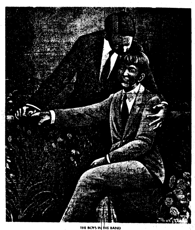
Mar Crowley shiftness of Thoulews in about a horrow said highly, party. To be written for the server and produced by Mart Crowley, and Robert Moore, who therefore the stage version will dipart by thin with necessive of the original cert.

Animated material, film by film, went to Movielab. They ran each 60 to 90 second three-screen segment together to make three prints in color when projected side by side. Editor Woody, then spliced all final 37 pieces of film, including titles and finale to make