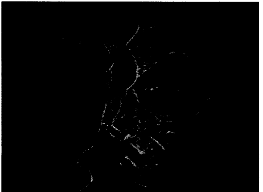
Woody Vasulka , Theater of Hybrid Automata , 1990.