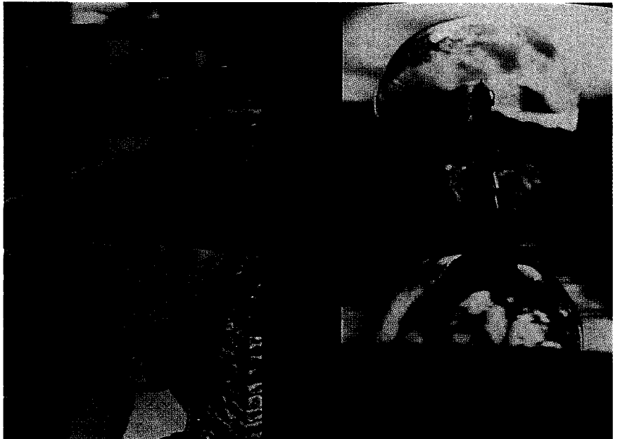
Steina Vasulka , Voice Windows , video stills with Joan LaBarbar.

The most convenient place to see the Vasulkas' responses to the "adventure of technology" is SFMOMA, where Steina & Woody Vasulka: Machine Media will be exhibited February 2 to March 31. A catalog is available. If you are planning a European trip this winter, Video/Virtuality: Steina & Woody Vasulka, runs to January 14 at the Palazzo delle Esposizioni, Rome. The Vasulkas' Machine Vision will be on view in the 3ème Biennale de Lyon at the Nouveau Musée d'art Contemporain and Le Palais des Congrès in Lyon, France, through February 20. ♦