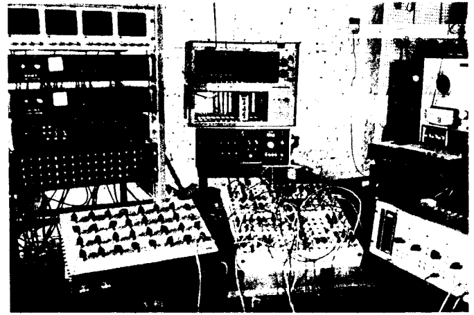
Figs. 2 and 3 The Experimental Television Center, Owego, New York

ters of the electronic signal, for example, frequency, amplitude, or phase, which actually define the resulting image and sound. 16