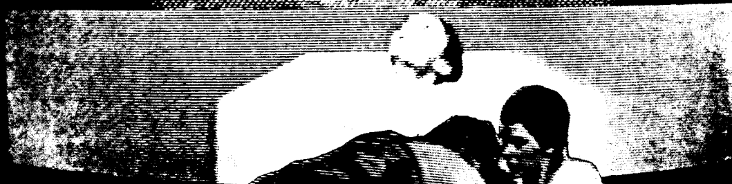
Scape-Mates , 1972