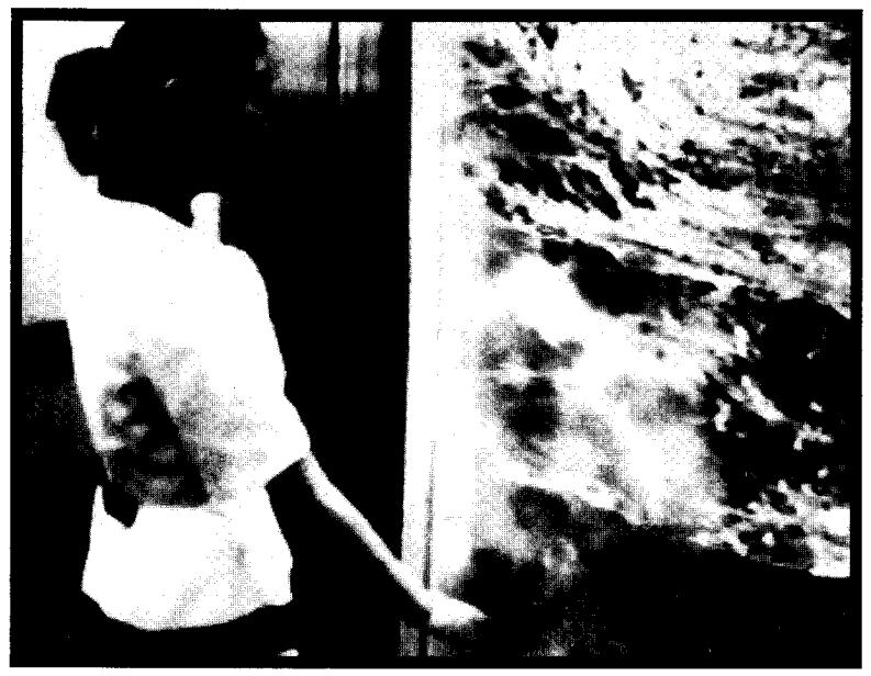
In The Land Of The Elevator Girls 1989 Steina & Woody Vasulka