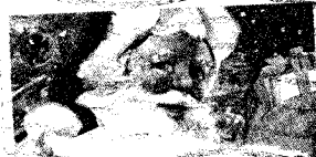
Season's Greetings USA 20c