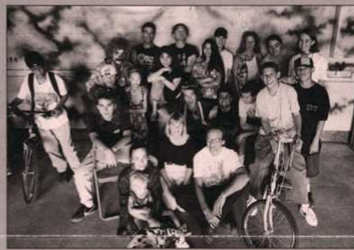
Teen project staff

Presentations are available on Warehouse programs and the Rainbow Project (a creative intervention program) for groups and schools. COMING SOON! Conference of the Birds written by Peter Brook and performed by the Theater of Urgency!!! Calling March 95! For more information, call the CCA Warehouse at 989-4423. The CCA Warehouse is located at 1614 Paseo de Peralta.