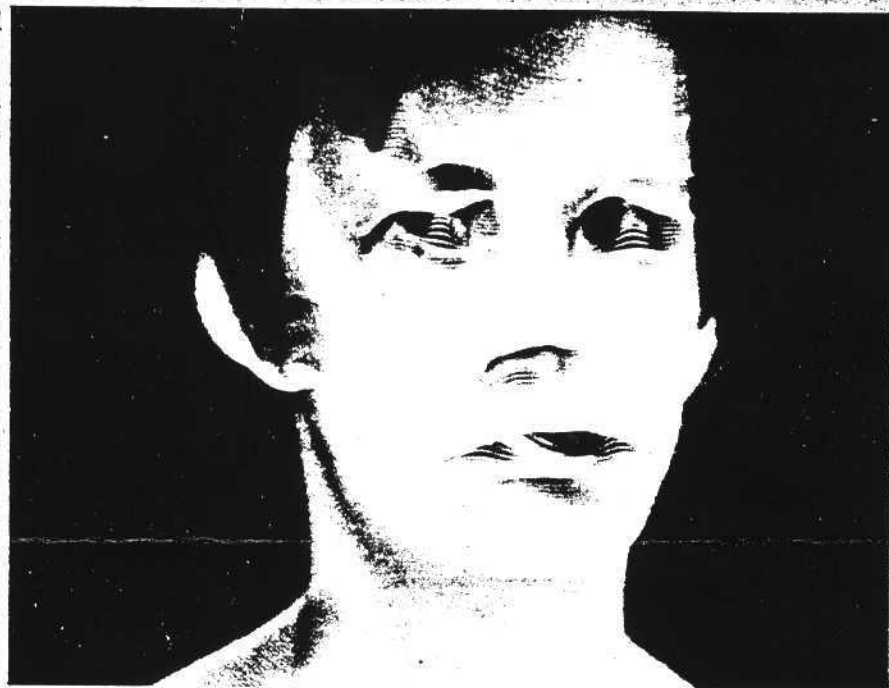
Steina's self-portrait alters the image, challenging our preconceptions.

Most people approach video like films: Cameras—film or video—are windows on the world. Steina and Woody Vasulka took this traditional stance when they began taping arts performances in New York lofts and clubs in the mid-sixties. But soon their frame of reference changed. They became more interested in how the camera worked than in what was in front of it. They covered the lens and constructed images, playing with pixels (the smallest unit of a video image), altering raster lines (the 525 lines that form the image on the screen), making pictures from inside instead of outside the camera.