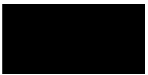
Dual Colorizer, 1972

want to call it. That takes black and white video signals, from 1/2" tape, like people who have been shooting with their portapaks, and it allows them to synthetically color the picture. This doesn't work out well for interviews or straight types of photography but it does work out extremely well when you move into the more visual and abstract things. And I found it also works out well with shots of natural mountains, sky, water, trees, nature, things like that colorize very well.