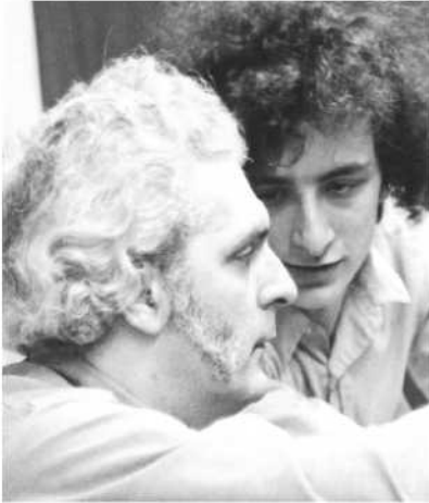
Robert A. Moog at conference on Electronic Art Tools, at SUNY, Buffalo, 1977