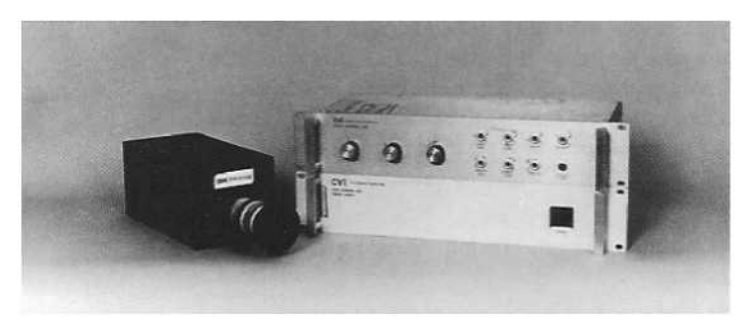
CVI Data Camera, 1970. Collection of ETC, Ltd. & The State University of New York, Binghamton.