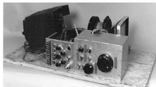
Paik/Abe Scan Modulator. Collection of ETC.