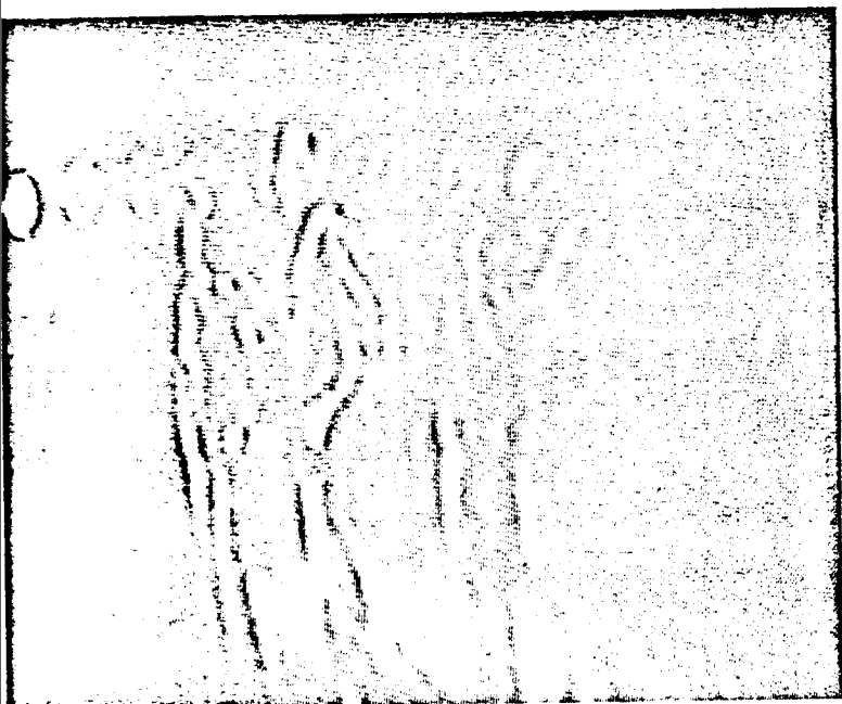
Ira Schneider, Infinity Machine, Infinity Loop, Video Echo , 1974.

Beryl Korot's Dachau tape plays with time on many levels. It is a four monitor work, with the monitors in a wall, side by side. There are about twenty images throughout the duration of the tape—a barracks with a man visible walking through the windows, people milling in corridors, walking across bridges. At any given moment there are generally two sets of similar images playing simultaneously, repeated many times in different sequences of time. That is, there will be two simultaneous images of the same scene with an event taking place in two different sequences of time. Yet the most powerful time element in the work is not in the structure but in the content. We are seeing Dachau thirty years later with tourists surveying it with the passive interest with which they might survey a document. In the end we see the image of an oven repeated four times, twice