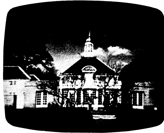
At the gallery in the Park