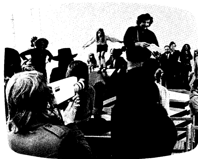
Live events you can take part in