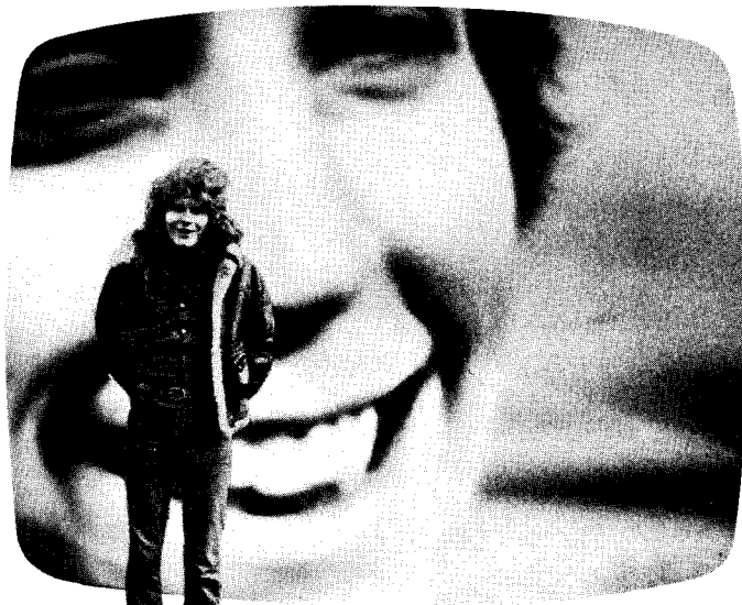
Giant TV screen