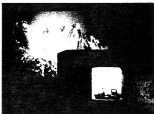
Room for St. John of the Cross, 1983, by Bill Viola